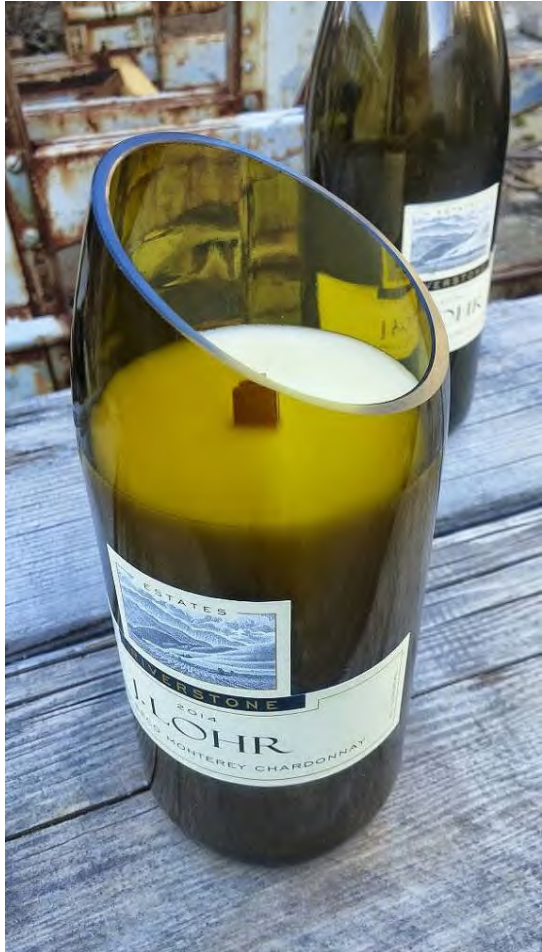
Appendix 12, Item 6